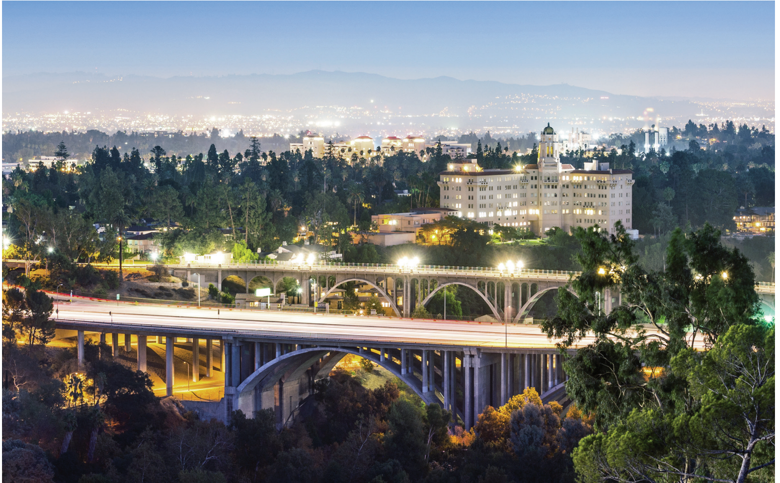
City of Hope